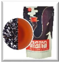
Above: one of many Government registered trademarks. This one for Tonics, Herbal Elixirs and Tonics and Medications. Other categories include accomodation, honey, biscuits and more. Image top right most (organic tea from Mana estates Assam. Tumeric, Gur and other products also available.